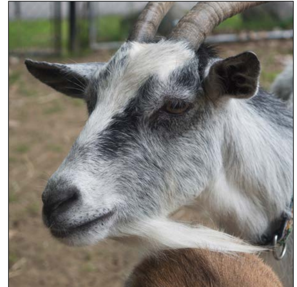
The NHSPCA is one of the few shelters in the state able to provide for farm animals while they wait for their forever home like Betty, pictured above.

for future adoption. Adopting an older horse can be a deeply rewarding, fulfilling endeavor and