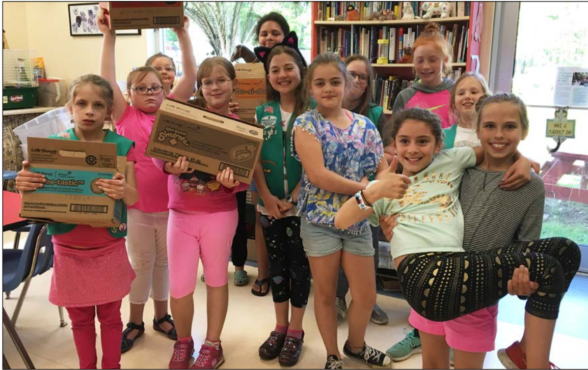
Members of Girl Scout Troop #12623 brought cheer and cookies to the NHSPCA staff.