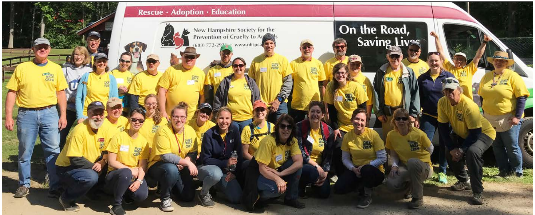
Volunteers and staff come together to celebrate the end of a successful Paws Walk on Sunday, June 3 at Stratham Hill Park.