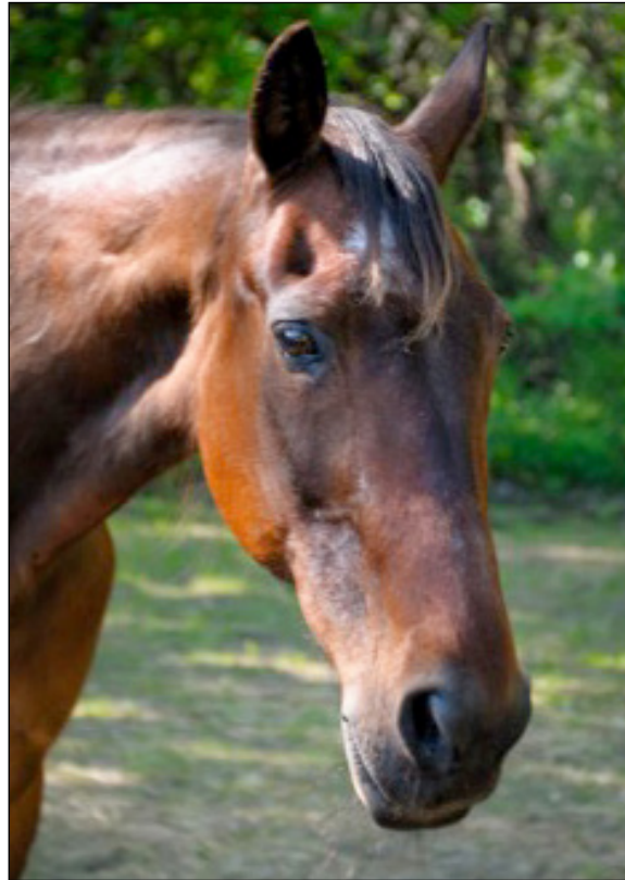
Handsome " Cannon " is a 30 year old Standard gelding looking for his forever home.

While our young horses are returning from winter training programs and transitioning into new homes, many of our senior horses continue to wait for the opportunity to settle into their well-earned retirement. Due to the influx in senior horses that have arrived at our shelter, we have tailored many aspects of our barn program to help us meet the needs of older equines. Our dedicated group of barn volunteers has been helping us provide these golden oldies with much needed TLC and nutrition as we prepare them