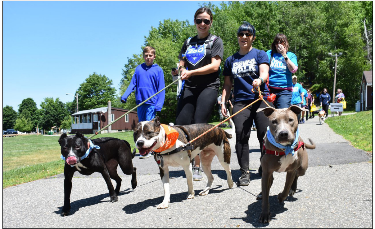
Walkers and their furry friends took advantage of the beautiful weather at Stratham Hill Park on Sunday, June 3, while participating in Paws Walk, a critical fundraiser for the NHSPCA.